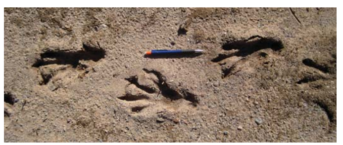
Figure 4. A beaver leaves distinctive tracks in the mud.

dam (Figure 5), beaver normally build bank dens or lodges out of sticks and mud. By damming a stream, beaver flood the bushes and trees which serve as their primary food source. Ponds also serve as a place to escape where a beaver can remain under water for a long period of time. They usually use bank dens in streams or where water levels fluctuate often, or lodges made of sticks and mud in shallow-water areas formed by their dams (Figure 6). Beaver enter their lodges or dens below the water level, but their living quarters are high and dry above the water level (Figure 7). Active lodges are easily recognized by