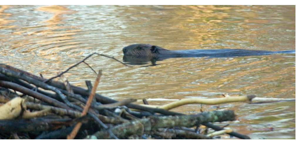
Arkansas Is Our Campus

The beaver is a large, stockyappearing rodent, generally 35 to 40 inches long from head to tail. It has a broad, flat paddle-shaped tail, short ears and generally brown fur. The beaver's tail is used as a rudder while swimming and is slapped against the water as a danger signal. The beaver's four large front teeth enable it to girdle or cut down large trees or other vegetation used as foods or dam and lodge construction materials. Their webbed hind feet have a