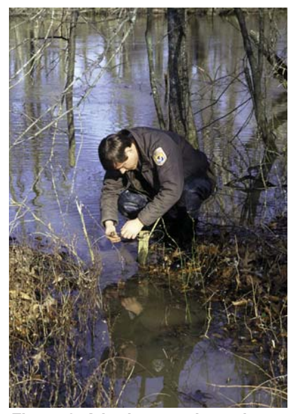
Figure 8. A body snare is set in a beaver run.

Where beaver are causing damage, trapping can be an effective and practical method of control. Foothold traps, Conibeartype traps and snares (Figure 8) are legal in Arkansas (leg snares are illegal). Trapping beaver generally is not as easy or productive as for other mammals, such as mink or muskrat. Beaver do not congregate like mink or muskrat and are