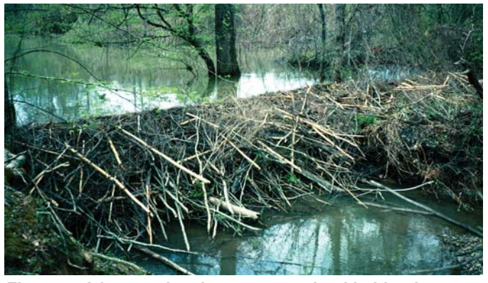
Figure 5. A beaver dam increases wetland habitat but can also flood valuable timber.

dam (Figure 5), beaver normally build bank dens or lodges out of sticks and mud. By damming a stream, beaver flood the bushes and trees which serve as their primary food source. Ponds also serve as a place to escape where a beaver can remain under water for a long period of time. They usually use bank dens in streams or where water levels fluctuate often, or lodges made of sticks and mud in shallow-water areas formed by their dams (Figure 6). Beaver enter their lodges or dens below the water level, but their living quarters are high and dry above the water level (Figure 7). Active lodges are easily recognized by