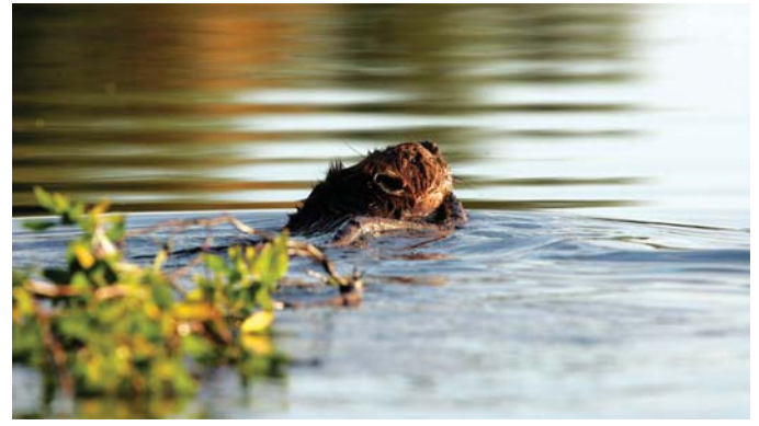
Figure 2. Beavers consume bark, twigs and leaves of willow trees and will store this food in their lodges.

Beaver are primarily nocturnal, both feeding and working during the night. Beaver are true vegetarians, eating only plant material. Their diet in Arkansas consists primarily of bark, twigs and leaves of trees such as sweetgum ( Liquidambar styraciflua ), cottonwood ( Populus spp.) and willow ( Salix nigra ) (Figure 2), but they may feed on any available tree species, including pine ( Pinus spp.) and Eastern red cedar ( Juniperus virginiana ). Beaver also eat the roots, stems and leaves of aquatic plants, as well as feed on agricultural crops such as corn ( Zea mays ), soybeans ( Glycine max ) and fruit trees. They will often store food in the den or lodge or under ice to eat during severe weather.