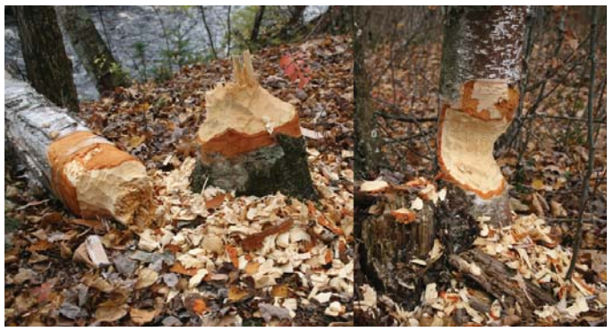
Figure 3. Beavers chew trees to construct dams and lodges.

tree cutting and girdling activity (Figure 3). Closer examination will reveal slides, "mud dobs," a lodge or den, tracks (Figure 4) and the dam. After building a