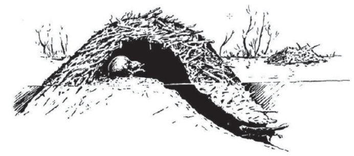
Figure 7. Diagram of a beaver lodge with an underwater entry.

fresh cuttings and mud on the lodge. There may be more than one colony of beaver in a large beaver pond or lake, but each colony defends its own territory.