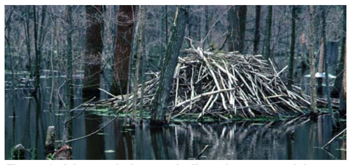
Figure 6. A beaver lodge symbolizes the successful return of nature's engineers to The Natural State.