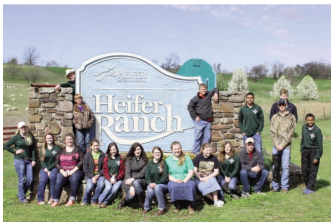
Prairie County and Lonoke County 4-H Teen Leaders toured Heifer Ranch over spring break to wrap up their Citizenship Workshop.

On March 25-26, 18 4-H youth and six adult volunteers from Lonoke and Prairie counties participated in a Teen Leader Global Citizenship Workshop, where they learned about sustainable solutions toward ending poverty around the world. Through hands-on activities, such as the The Paper Bag Game, World Water Supply Experiment and The Poverty Challenge Simulation, youth learned about how our everyday actions affect both the global environment and people around the world.