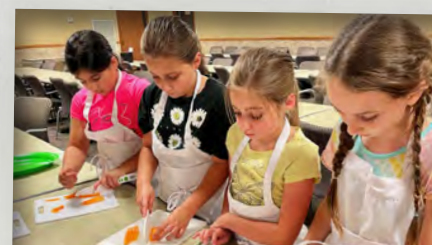
Participants practice knife skills at the Miss. Co. 4-H Food and Fun Cooking Camp at NEREC.

Food and Fun Cooking Camps were offered in the north end of the county at Arkansas Northeastern College and in the south end at NEREC in Keiser. Participants learned basic food preparation skills, prepared several recipes each day and received 4-H information and basic nutrition facts. Etiquette Essentials camp participants wrote invitations with RSVP requests and thank you notes, practiced making introductions, learned about table setting and more. The camp culminated in a formal tea with invited guests at the ANC Governor's Ballroom.