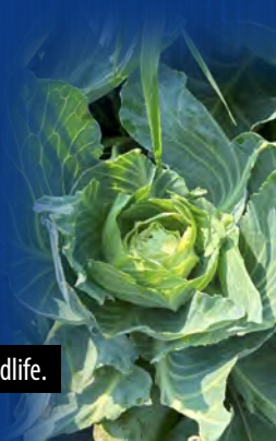
Cabbage damaged by wildlife.