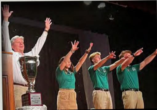
State 4-H officers 'Call the Hogs' during the opening session of the State 4-H O'Rama. WPS!

We look forward to hosting State O-Rama again next summer! To learn more about how you can get involved in 4-H, check out: https://4h.uada.edu/about/default.aspx . ■