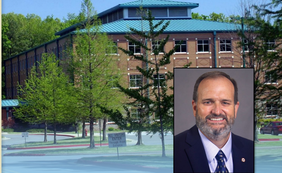
FROM THE DIRECTOR