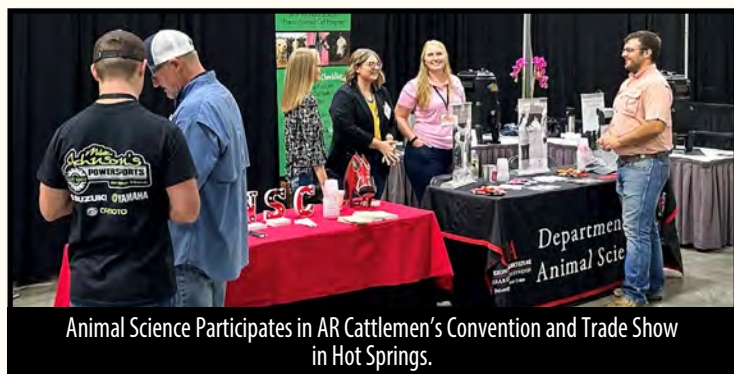
Animal Science Participates in AR Cattlemen's Convention and Trade Show in Hot Springs.

Animal Science faculty, county extension agents, district directors and students attended the 65th Annual Arkansas Cattlemen's Association Convention & Trade Show in Hot Springs. It was great to visit with current supporters of our program and make new friends at our trade show booth, providing extension materials and Bumpers College information to attendees. We are already looking forward to next year's convention. ■