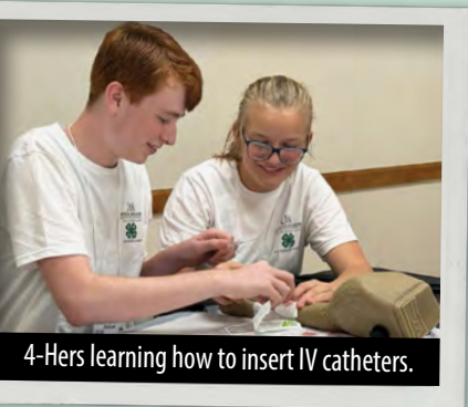
4-Hers learning how to insert IV catheters.

Providence Veterinary Care, Nashville Animal Hospital and Arkansas Game and Fish Commission partnered with Hot Spring County to provide youth with an opportunity to work alongside professionals.