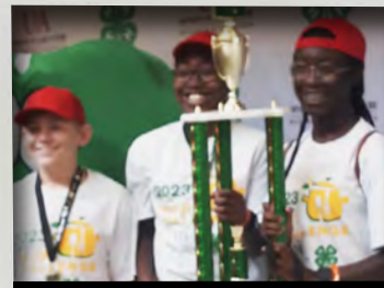
Team Sauteed and Flambeed take top honors at the 4-H Food Challenge!