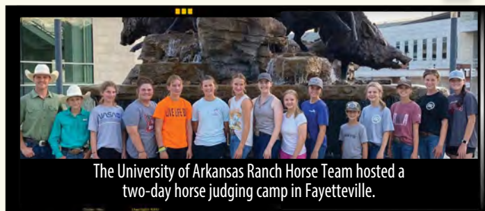
The University of Arkansas Ranch Horse Team hosted a two-day horse judging camp in Fayetteville.

During each morning and evening session, students learned and improved their abilities in the four events of ranch horse competition: working cow horse, reining, ranch trail, and ranch riding. During the heat of the day, students moved