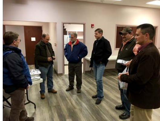
The Farm Management Series planning team discusses plans for an upcoming meeting.

Other key partners who have stepped up to help plan, sponsor and provide speakers for the series include Cleveland Crop Insurance, Delaplaine Seed Company, Farm Bureau, Farm Credit MidSouth, the Clay County Farm Service Agency and Legacy Equipment Company. ■