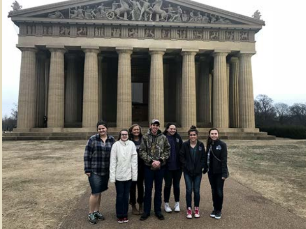
Arkansas 4-H officers at the Parthenon.

The state 4-H officer team had the opportunity attend the 99th AFBF annual convention in Nashville, Tennessee, on Jan. 5-10. This was the first year for the AFBF to offer a youth leadership component, and thanks to some help from the Arkansas Farm Bureau Federation, our state officers were able to participate in this unique event. These young leaders were introduced and interacted with other 4-H'ers and FFA members from all over the United States.