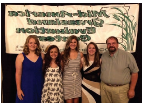
Van Buren County Mid-America Grassland team