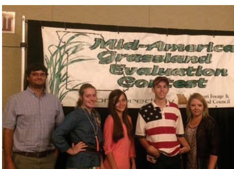
White County Mid-America Grassland team