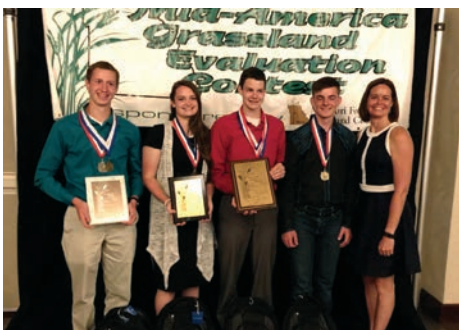
Cleburne County 4-H team – First-Place 4-H Team and Overall High Point Team at the 2016 Mid-America Grassland Evaluation Contest