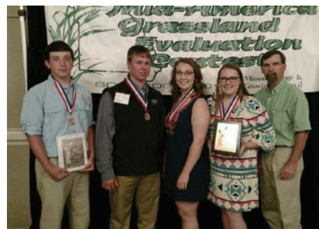
Third-Place 4-H Team – Randolph County Mid-America Grassland team