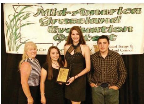
Fifth-Place 4-H Team – Madison County Mid-America Grassland team