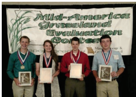
First-, Second-, Third- and Fifth-Place Individuals at the 2016 Mid-America Grassland Evaluation Contest