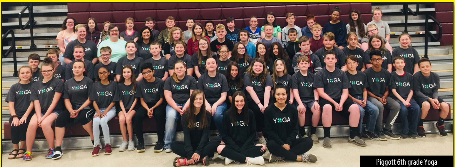
Piggott 6th grade Yoga