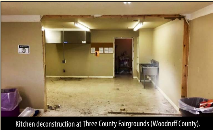
Kitchen deconstruction at Three County Fairgrounds (Woodruff County).