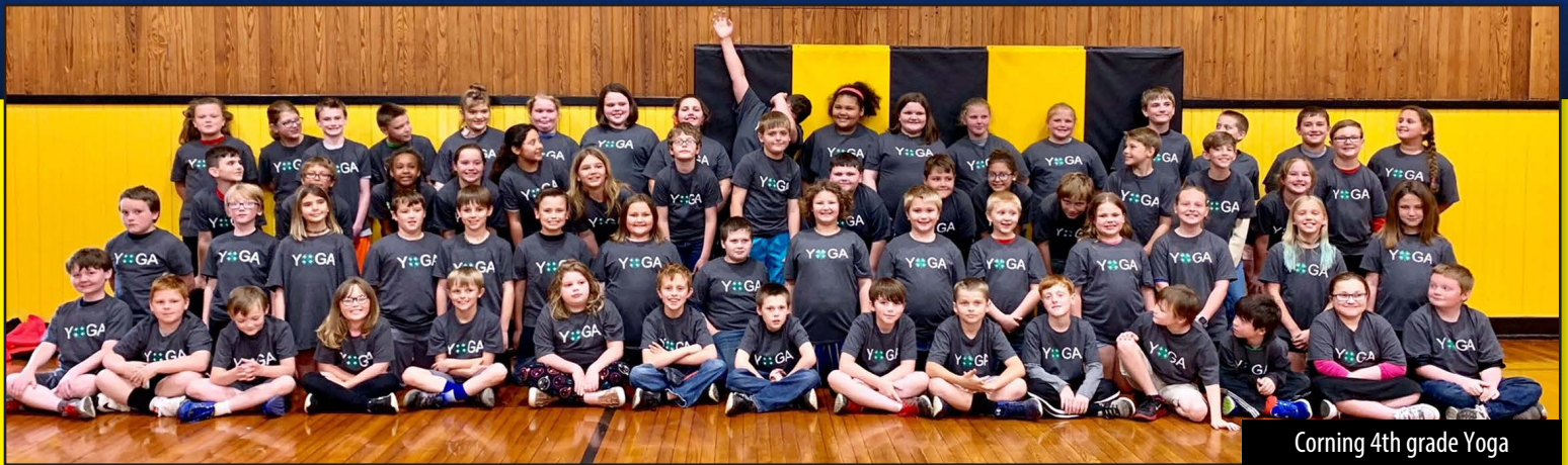
Corning 4th grade Yoga