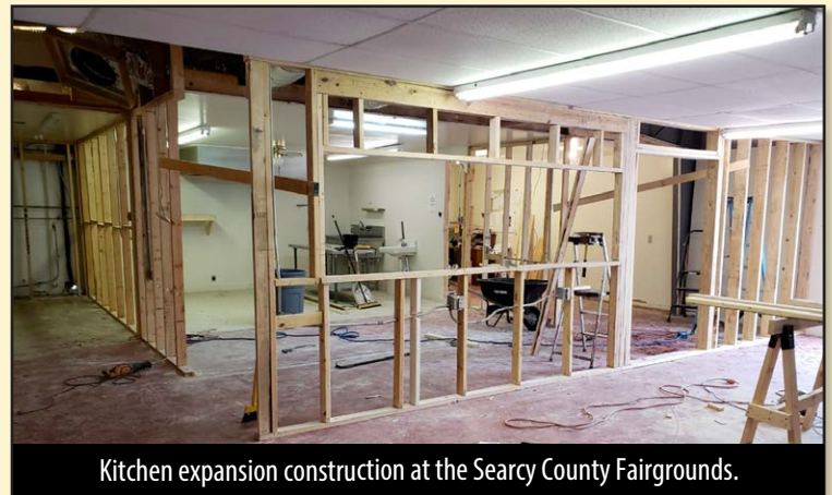
Kitchen expansion construction at the Searcy County Fairgrounds.