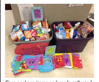
Care package items and cards collected for troops deployed to Afghanistan.