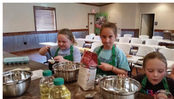
Junior 4-H bread makers learn about different leavening agents and fats.