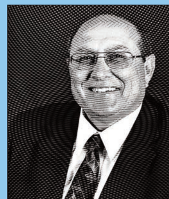
FROM THE DIRECTOR