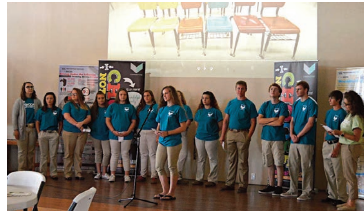
4-H teens spoke at appreciation dinner.