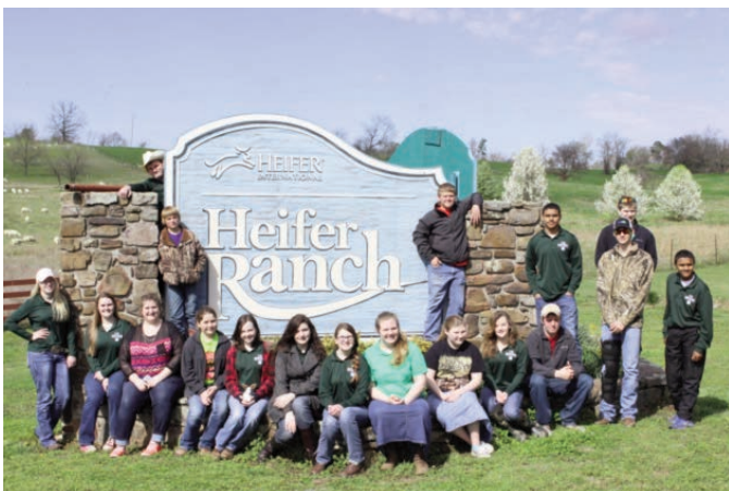
Prairie County and Lonoke County 4-H Teen Leaders toured Heifer Ranch over spring break to wrap up their Citizenship Workshop.

On March 25-26, 18 4-H youth and six adult volunteers from Lonoke and Prairie counties participated in a Teen Leader Global Citizenship Workshop, where they learned about sustainable solutions toward ending poverty around the world. Through hands-on activities, such as the The Paper Bag Game, World Water Supply Experiment and The Poverty Challenge Simulation, youth learned about how our everyday actions affect both the global environment and people around the world.