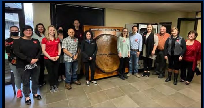
iLEAD Cohort 1 at the University of Arkansas at Monticello (UAM) where they continued to learn about the wide reach of the Division.