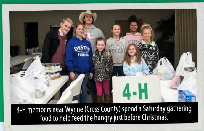
4-H members near Wynne (Cross County) spend a Saturday gathering food to help feed the hungry just before Christmas.

Cross County 4-H members collected more than 300 pounds of canned goods and food for The Wynne Church of Christ Food Pantry as part of their Christmas Community Service Food Drive. ■