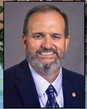
FROM THE DIRECTOR