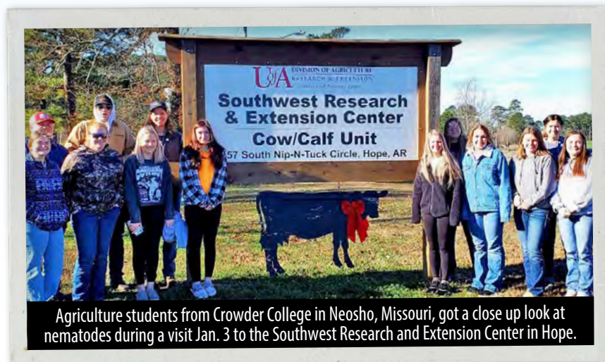
Agriculture students from Crowder College in Neosho, Missouri, got a close up look at nematodes during a visit Jan. 3 to the Southwest Research and Extension Center in Hope.