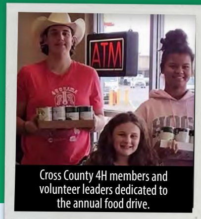
Cross County 4H members and volunteer leaders dedicated to the annual food drive.