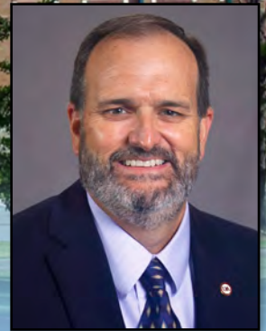
FROM THE DIRECTOR