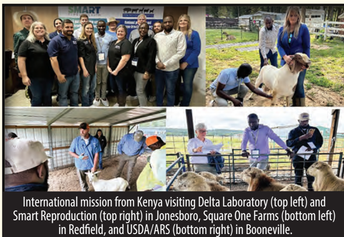
International mission from Kenya visiting Delta Laboratory (top left) and Smart Reproduction (top right) in Jonesboro, Square One Farms (bottom left) in Redfield, and USDA/ARS (bottom right) in Booneville.

gation from Kenya, with representatives from the Kenya Agriculture and Livestock Research Organization and the Meat and Livestock Industry Council, visited Arkansas to learn about our research and technology applied to sheep/goat production as well as prospecting future commercial relationships.