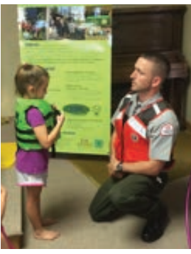
A park ranger with the Corps of Engineers helps a camper make sure her life jacket is the correct size for her.

This summer's theme for Cloverbud day camps in Lonoke and Prairie Counties was 4-H20 Splash Camp! Summer day camps are utilized in Lonoke and Prairie Counties as a recruitment tool to reach more youth through 4-H. Fifty youth were reached through the two-day camps. Campers learned about water safety and how to properly fit a life jacket from park rangers with the Corps of Engineers, had fun with science by making Oobleck with