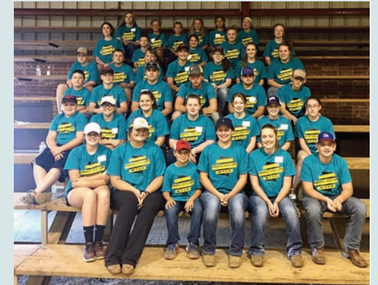
Thirty-seven participants attended the first Arkansas Show Camp at the Washington County Fairgrounds June 26-27.

Without the knowledge from these instructors and support from our sponsors, including Purina, Fayetteville Co-Op, Elanco and Boehringer-Ingelheim, this camp would not have been successful. ■