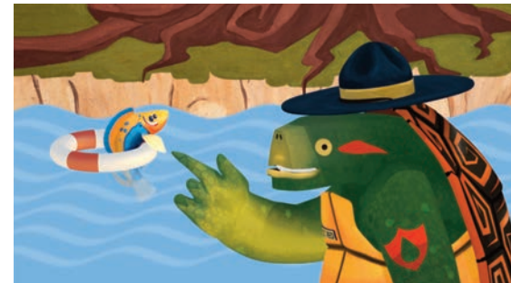
Sgt. Red and his friend Mingo discuss ways for urban residents to prevent water pollution.

When asked, "After viewing the commercials, do you understand the actions you need to take to prevent pollution from entering the water?" 38.5 percent reported Yes, 0 percent No, 3.8 percent Unsure, and 57.7 percent said they already knew how to prevent pollution. Because of the favorable outcomes of the commercials, they will continue on another innovative outreach method – the local gas station television network. ■