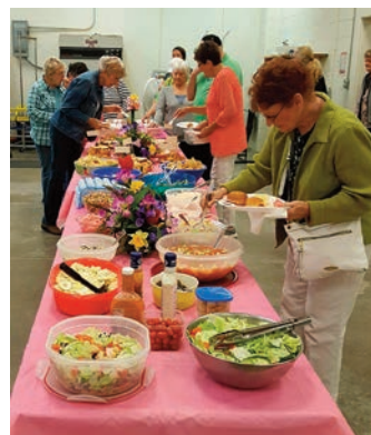
Angel Works Luncheon participants enjoyed food provided by Newton County EHC members.