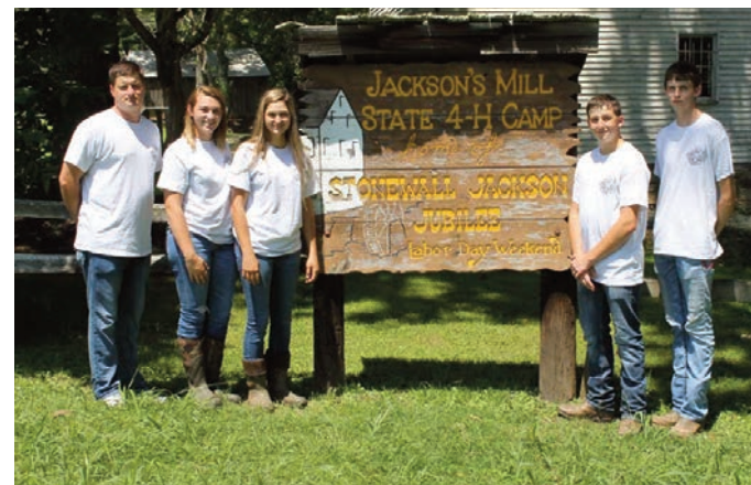
Bradley County team which placed first at the National 4-H Forestry Invitational.

The event is sponsored by Farm Credit System, Sustainable Forestry Initiative, Inc., USDA Forest Service State and Private Southern Region, West Virginia University Extension Service, American Forest Foundation, Southern Regional Extension Forestry, Association of Natural Resource Extension Professionals, National Woodland Owners Association and Black Diamond Resource Conservation and Development Council. ■