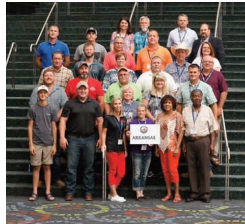
The Arkansas delegation.