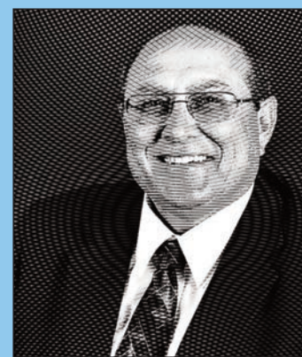
FROM THE DIRECTOR