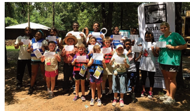
Day camp participants take the water safety pledge.