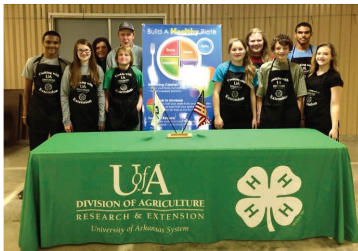
4-H Teen Leaders completed six hours of healthy living and leadership development training.

Lonoke and Prairie County 4-H recently hosted a healthy lifestyle ambassador training for 4-H teens. Ten youth were trained to become Teen Teachers as a part of the National 4-H Council and Walmart Foundation Youth Voice: Youth Choice Healthy Living Sub-Grant. At the training, youth were divided into groups with the task of planning and then presenting lessons from the Choose Health: Food, Fun, and Fitness curriculum. They will be teaching these lessons during 2016 summer day camps. They also participated in an Iron Chef Challenge and got active with a MyPlate Relay and yoga obstacle course. ■