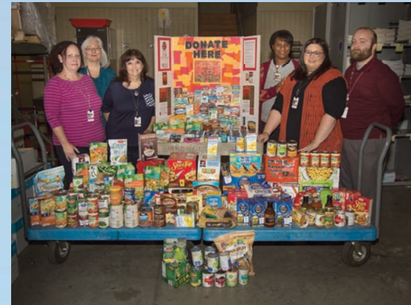
The Chi Epsilon Sigma food drive collected more than 230 pounds of food for the Arkansas Food Bank.