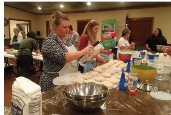
Participants prepare pie crusts in batches to freeze for winter meals.

The Polk County Extension Homemakers recently formed a new club focused on preserving home skills. In November, members and potential members gathered for a pie crust workshop where all participants made a bulk pie crust recipe. The recipe produced approximately 20 pie crusts per batch that participants could freeze and use to prepare meals for the holidays. An educational handout, Sweet or Savory? , provided some savory recipes participants could use for pot pies and quiches that make inexpensive meals for the holiday season.