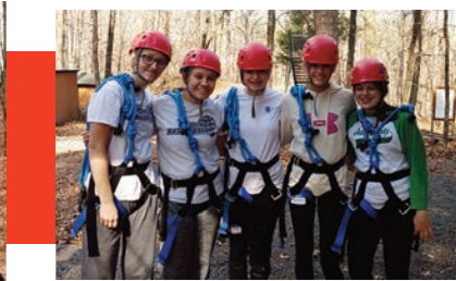
Fifteen students from Perryville High participated in leadership development activities at the Arkansas 4-H Center, including a low ropes course, rock wall climbing and ziplining.