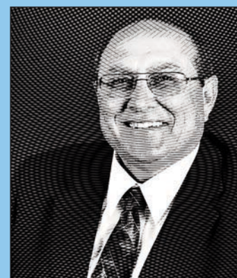
FROM THE DIRECTOR