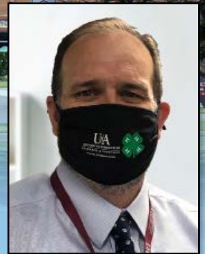
FROM THE DIRECTOR