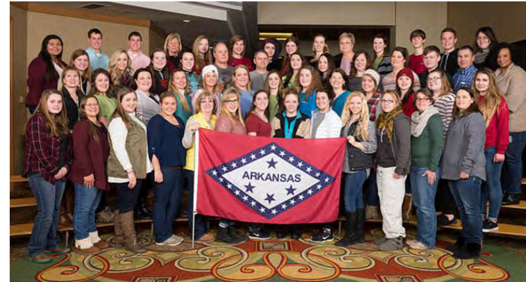
The Arkansas delegation to the Western National Roundup in Denver.