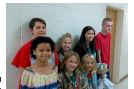
Cross County 4-H'ers deliver donated food to Church of Christ food pantry.

Soaring Eagles, Cross Roads and the other 4-H clubs donated canned goods and other food items to the church food pantry. Giving back to the community is a part 4-H plays in teaching the youth community services. ■