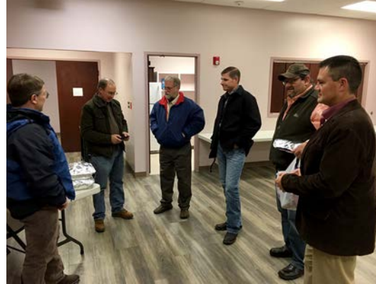
The Farm Management Series planning team discusses plans for an upcoming meeting.

Other key partners who have stepped up to help plan, sponsor and provide speakers for the series include Cleveland Crop Insurance, Delaplaine Seed Company, Farm Bureau, Farm Credit MidSouth, the Clay County Farm Service Agency and Legacy Equipment Company. ■