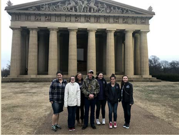
Arkansas 4-H officers at the Parthenon.

The state 4-H officer team had the opportunity attend the 99th AFBF annual convention in Nashville, Tennessee, on Jan. 5-10. This was the first year for the AFBF to offer a youth leadership component, and thanks to some help from the Arkansas Farm Bureau Federation, our state officers were able to participate in this unique event. These young leaders were introduced and interacted with other 4-H'ers and FFA members from all over the United States.