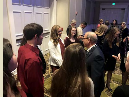
Arkansas 4-H officers meet Lawrence MacAulay, Canadian Minister of Agriculture.

The kids had a great time, also getting to see some of the sights of Nashville, such as the Opryland Hotel and the Parthenon. All and all, this was a unique opportunity on many levels and had an obvious impact on the kids, helping to expand their world as they continue to grow into young adults. ■