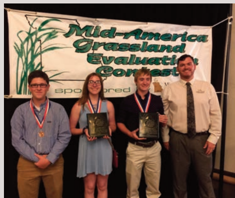
Fulton County 4-H team – Third place 4-H team and fifth high individual at the 2017 Mid-America Grassland Evaluation Contest.