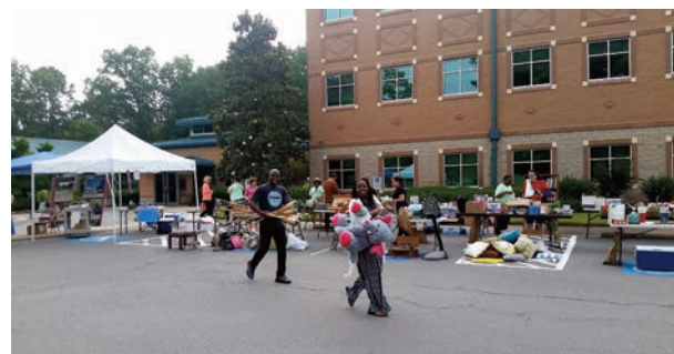
Satisfied shoppers at the Chi Epsilon Sigma yard sale.