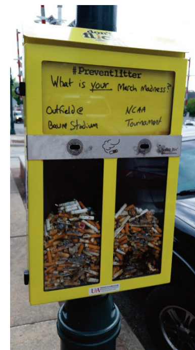
Entertainment District patrons fill ballot bins and reduce tobacco litter in Fayetteville by "voting" on recent sporting events.

This demonstration project is funded through the Arkansas Natural Resources Commission 319 grant program to raise awareness about urban pollutants carried by runoff into local waterways through storm drains. ■