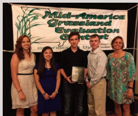
Cleburne County 4-H team – Fourth place 4-H team and second high individual at the 2017 Mid-America Grassland Evaluation Contest.

The contest included a field of 16 teams from five states including Arkansas, West Virginia, Indiana, Ohio and Missouri.