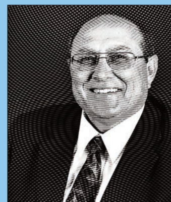
FROM THE DIRECTOR