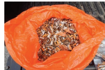
Cigarette butts collected in ballot bins and two urban cleanups are packaged for recycling through Terracycle, Inc.

Ballot bins are an engaging way to address cigarette butt litter by encouraging users to respond to a question and "voting" by disposing of their cigarette butt in one of two receptacles, allowing a public opinion poll to be generated (Hubbub UK, 2016).