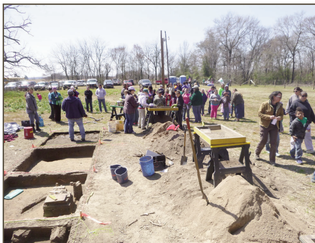
Youth gather with Arkansas Archeological Survey and Society volunteers to learn about how field work happens.

As the youth were leaving the site, one six year old was overheard telling his mother that he wanted to be an “Air Force race car driver-archeologist.” Overall, the 4-H youth had a tremendous time learning in a fun, hands-on experience. ■