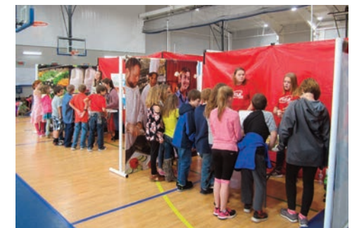
Students participating in Arkansas Farm to You stations.

Groups of eight to 10 students spent about five minutes at each station participating in activities and learning about the relationship between agriculture, food and health. ■