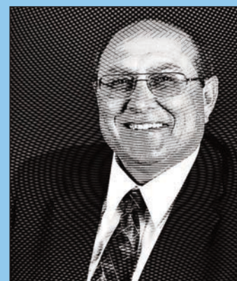
FROM THE DIRECTOR