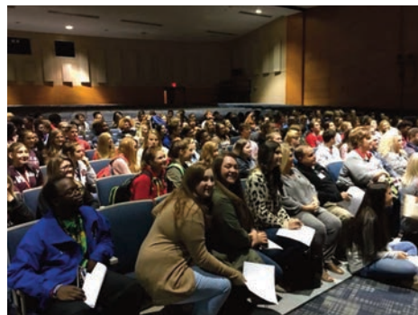
Tenth-grade students and peer ambassadors at Wynne High School.

More than 225 10th-grade students participated in “Get Real, Here’s the Deal” classes and an interactive exhibit at the Wynne High School 10th-grade academies on Oct. 27. Assisted by nearly 60 business and community leaders, the students faced adult financial issues as they negotiated the exhibit.