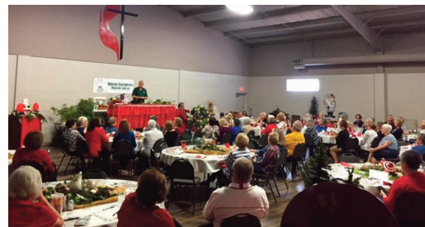
Participants enjoyed lunch and learned from speakers at the Fall Seminar.