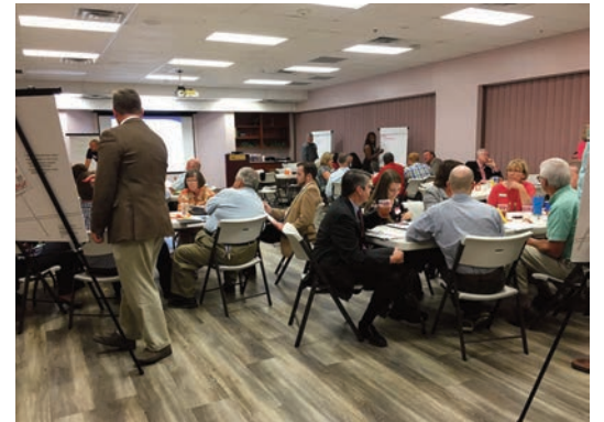
Stakeholders engage in table discussions during civic forum held in Paragould on Sept. 27, 2017.

To learn more about the program and view progress for each region, visit www.uaex.edu/SET . ■