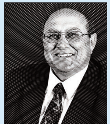
FROM THE DIRECTOR