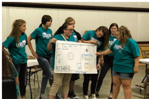
The "blue" personality group explains their design for the perfect school.

Members of this club are all ninth-grade students nominated by the three school districts in Marion County. They focus on leadership skills, personal development, healthy living and citizenship. Funding is provided by various community and foundation grants. ■