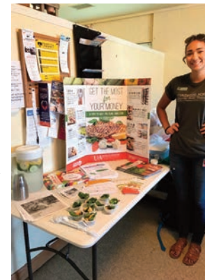
Dietetic interns from Arkansas State University served their community nutrition rotation “learning-by-doing” about Cooperative Extension Service programs. Students conducted nutrition education lessons at various food pantries, school programs and community centers.