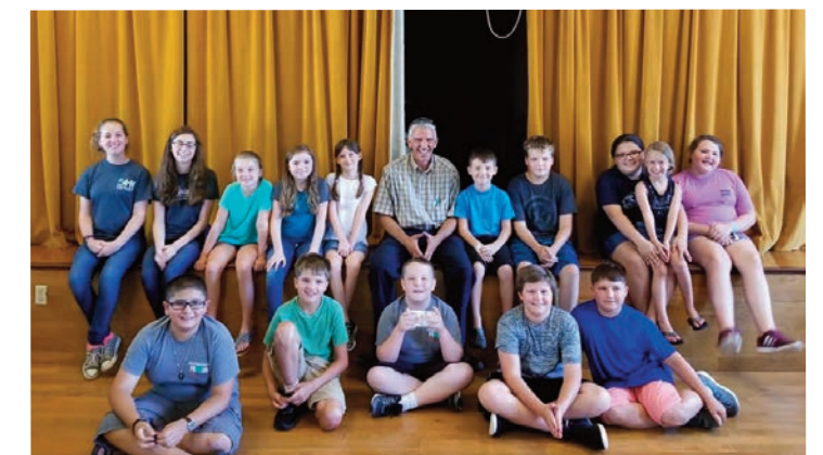
Participants in Sebastian County 4-H CSI Camp.