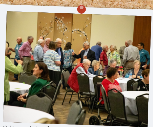
Retirees visit before lunch begins.