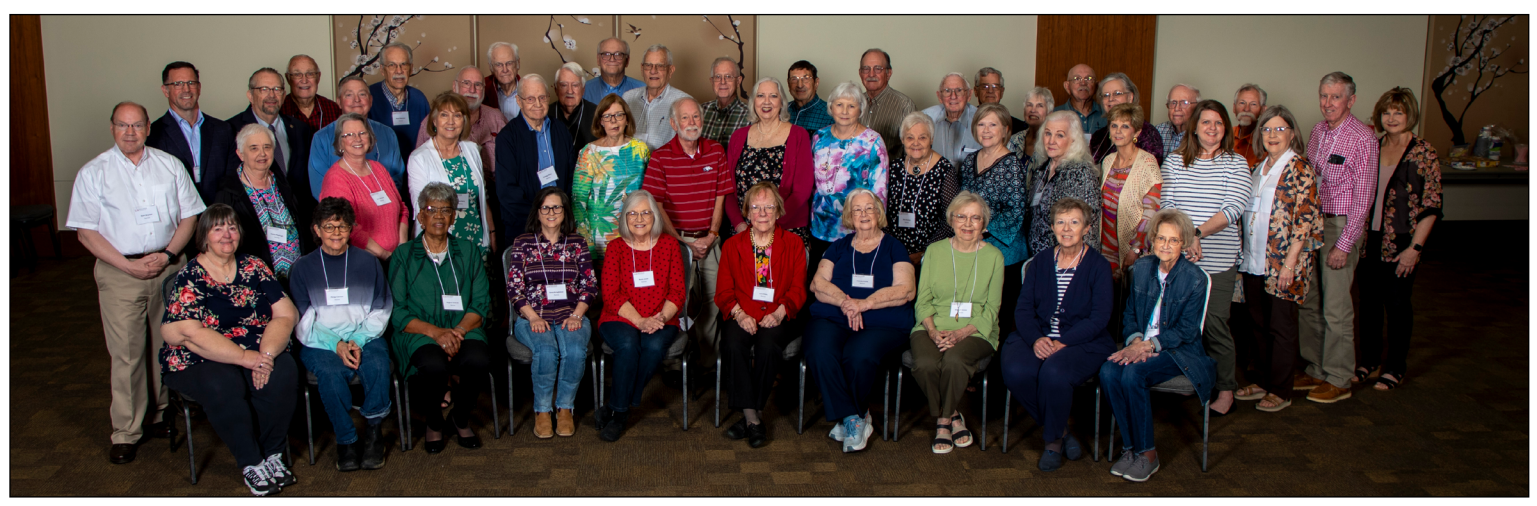
Retirees pose for a group photo at the 2024 Retiree Reception & Luncheon