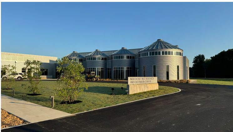
The new Northeast Rice Research and Extension Center was freshly manicured and ready to welcome guests to the inaugural NERREC Rice Field Day on August 8.