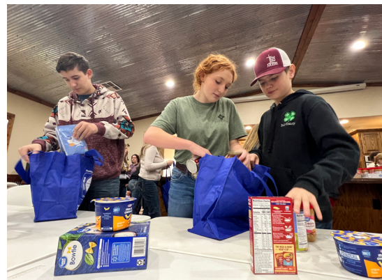
Polk County 4-H members pack food bags to deliver as part of the county's Santas for Seniors community service project.