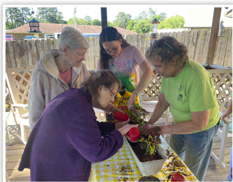
Saline County Master Gardeners joined elderly residents of the Southern Trace Rehabilitation and Care Center in Bryant on May 12 to plant flowers, part of the facility's celebration of National Skilled Nursing Care Week.

"These ladies from our memory care unit are the most ambulatory residents