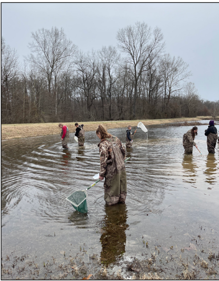
4-H students use nets to skim a flooded field for invertebrates, plants, and other duck foods.

Duck hunting is a passionate pastime for many Arkansans and their families. The Natural State falls within the Mississippi Flyway, the route followed by ducks migrating from their breeding grounds in North America to their wintering grounds in the South.