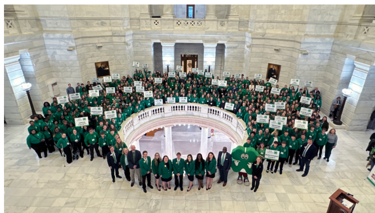
Arkansas 4-H members get a quick group photo before hearing from constitutional officers during 4-H Day at the Capitol.

“I love how we get to talk to our legislators and meet people who run our state,” she said.