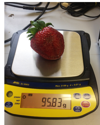
BERRY BIG — The Fronteras variety strawberry that won this year’s informal competition between research stations.