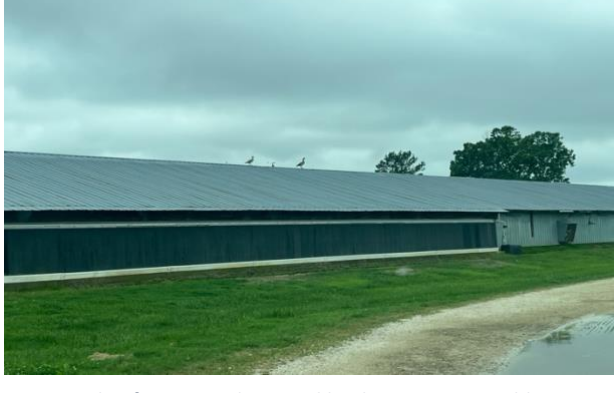
2: A couple of unwanted guests like these geese, could mean big trouble for poultry farms

Typically, warmer weather slows down the spread of Highly Pathogenic Avian Influenza, but so far this has not been the case. In the last 30 days there have been 11 confirmed cases, 9 commercial flocks and 2 backyard flocks, totaling almost 6 million birds. Be ever vigilant with your biosecurity practices, and if you see something say something or get help, as Dr. Dustan Clark would say.