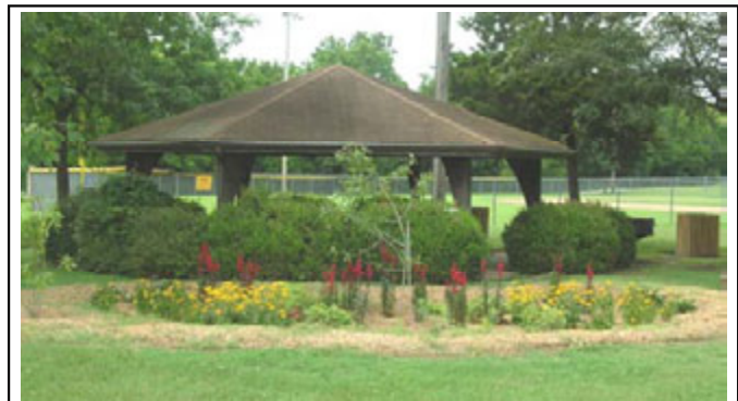
This rain garden of native trees, shrubs and perennial flowers captures stormwater runoff from a park pavilion roof