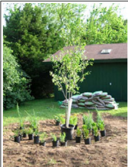
Examine plant placement before digging