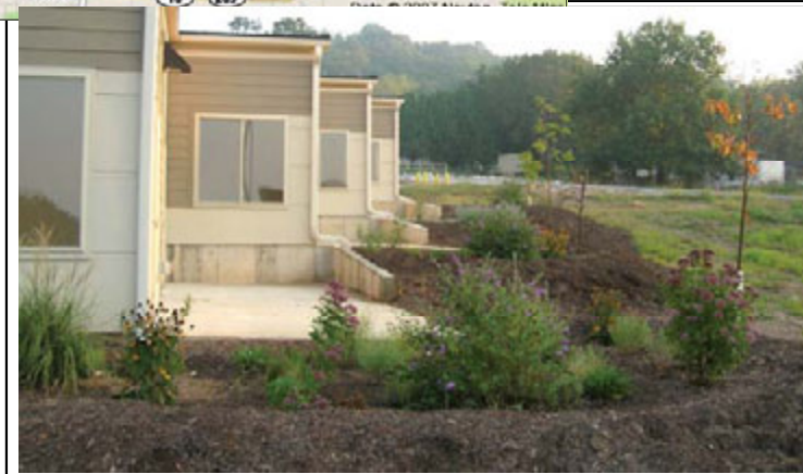
Gutter downspouts are directed into each of the four rain gardens at the Seven Hills Supportive Housing Facility

U of A UNIVERSITY OF ARKANSAS DIVISION OF AGRICULTURE Cooperative Extension Service