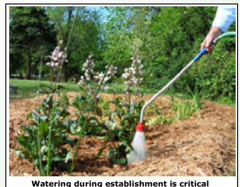
Watering during establishment is critical

In the fall, leaving plants intact will provide winter interest, but clearing dead vegetation and applying a new layer of mulch in the spring will prepare the plants for a new growing season.