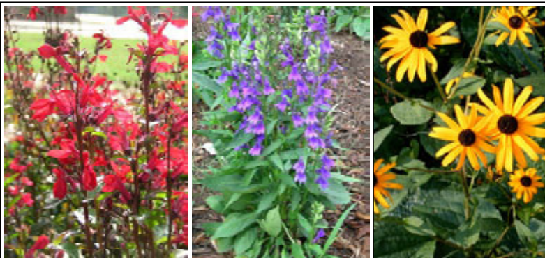
Cardinal Flower, Lobelia, and Black-Eyed Susan thrive in NW Arkansas rain gardens

As with all landscape design, consider plant size, color, texture and sun/shade tolerance when deciding on a planting scheme. Although not as showy within the first couple of years, an economical way to establish a rain garden is to buy plants as seedlings or in very small containers. The demonstration rain gardens across Fayetteville showcase several native plants, shrubs and trees. In fact, the four rain gardens at the Seven Hills Supportive Housing facility exclusively feature plants that serve as butterfly host plants or nectar sources.