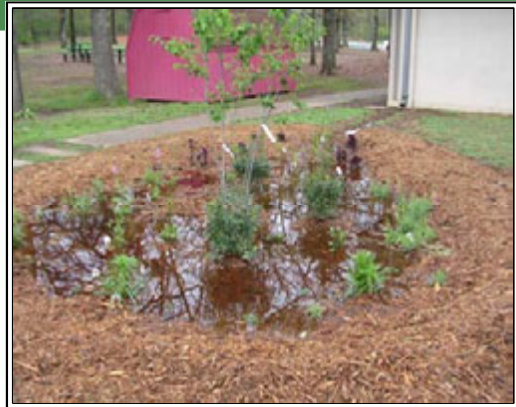
Downspouts direct roof runoff into a rain garden

Be sure to build your garden at least 10 feet from buildings so water soaking into the ground will not damage the foundation. Also, do not build the garden directly over a septic system or under a large tree. Finally, avoid areas where water already ponds after a storm since rain gardens