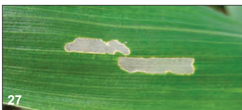
Windowpaning caused by fall armyworm larval feeding