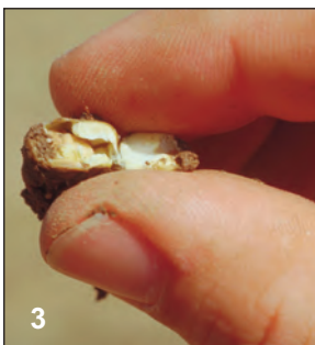
Seedcorn maggot damage to seed

Damage: Maggots feed on germinating seed and seedling plants by tunneling or burrowing. Damaged seed may fail to germinate, or the plant may sustain poor vigor following emergence. Damaged plants that emerge will likely appear wilted, stunted or otherwise unhealthy. If seedcorn maggots are suspected, carefully dig up seed in areas of the field where plant stands have been reduced or failed to emerge. Look closely for small, yellowish-colored maggots feeding on the seed or seed contents.