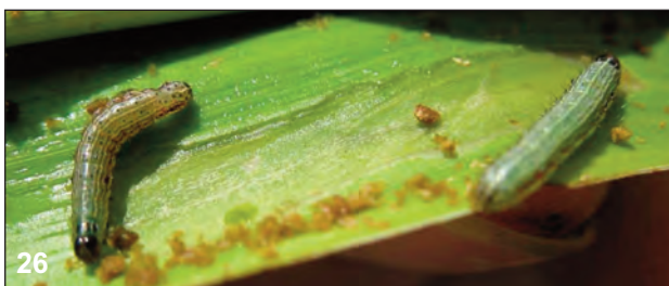
Fall armyworms in whorl

tissue resulting in a tattered appearance on the leaves similar to injury caused by corn earworm.