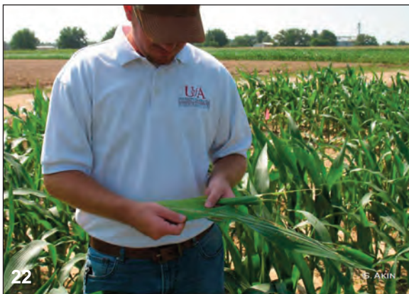
Checking whorl for injury

Injury to field corn in the whorl stage can be fairly conspicuous, particularly when the injury results in loss of leaf tissue. This injury can be identified either by ragged and irregular holes or “windowpaning” of corn leaves by various pests or small “shot holes” caused by corn borers. Previous research suggests that corn is relatively tolerant to defoliation once in the whorl stage, and treatment with a foliar insecticide at this stage rarely results in increased yield. However, feeding by heavy, sustained infestations of defoliating pests may lead to deadheart and subsequent reduced yield. If this is the case, it is very important to identify the pests causing whorl damage because of the differences in insecticide susceptibility among them. Most often, early planting is the most effective method for management of pests that feed in the whorl.