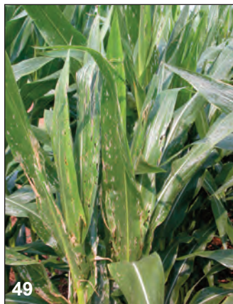
Corn borer damage

Damage: Corn borers cause plant injury by leaf feeding, stalk tunneling and ear feeding. Tunneling reduces translocation of nutrients through the plant, and stalks that are significantly weakened may break over (lodge). Most yield loss, however, is related to lodging of plants, resulting in failure to pick up those plants with a combine at harvest. Additionally, larvae of