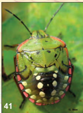
Southern green stink bug nymph