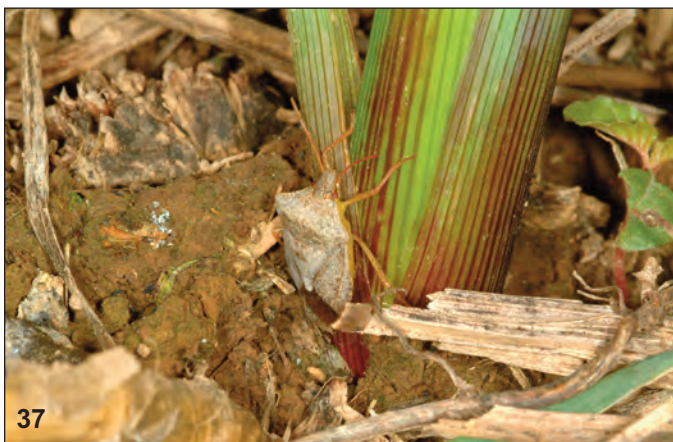
Brown stink bug

Management: Many insecticides are effective against stink bugs that can be found in corn. However, differences in control are often noted between brown and green stink bugs, with green stink bugs being typically easier to control with labeled pyrethroids than brown stink bugs. Adequate spray volume, however, is recommended in order for the insecticide to penetrate the canopy of taller corn.