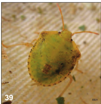
Brown stink bug nymph

green stink bugs, with green stink bugs being typically easier to control with labeled pyrethroids than brown. Adequate spray volume, however, is recommended in order for the insecticide to penetrate the canopy of taller corn.