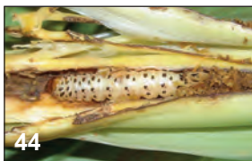
Southwestern corn borer larvae