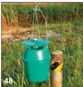
Corn borer trap

Pheromones are available for monitoring adult populations of southwestern corn borer (SWCB) and to some extent European corn borer (ECB), but not for the SCB. Both SWCB and SCB larvae can be observed in two forms, summer and winter. In SWCB, the summer form is white with black spots, while the winter form is creamy-white with barely-visible spots. The SCB is typically white with a brown head, and the summer form has brown spots on each body segment. The winter form of SCB lacks spots altogether.