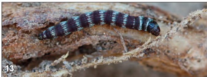
Lesser cornstalk borer

Damage: Larvae cause damage to the corn plant by boring into the base of the stem, which can cause dead-heart and ultimately stand reduction if numbers are high. Lesser cornstalk borer often makes silken tubes from the soil level attached to the plants. Wilting is one of the first signs of attack in affected plants, but withering of buds, stunting and plant deformities are common. Plant death is not uncommon, and infested areas of fields often have a thin stand.