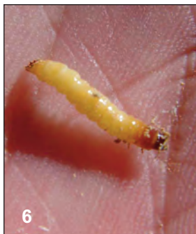
Southern corn rootworm

Damage: Plants that have been damaged may appear wilted, with the emerging whorl leaf of plants wilting first. If plants are severely injured, death of the plant may occur. Carefully inspect wilted plants for the presence of rootworm larvae. Carefully remove plants from the soil and closely inspect the crown of the seedling plants just below