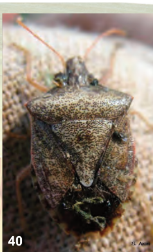
Brown stink bug adult