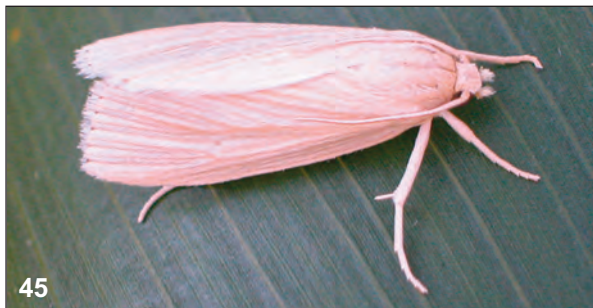
Southwestern corn borer adult