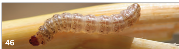
European corn borer