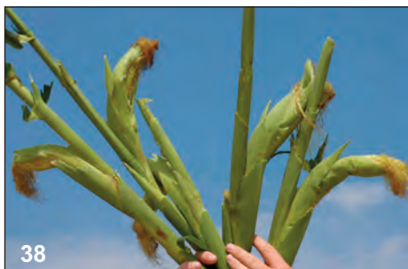
Stink bug damage

Damage: Stink bugs probe plants with their beak-like mouthpart and inject enzymes into the plant tissue before removing plant juices. Significant ear damage is likely when ears are less than 3/4 inch long. Plants damaged during early ear development may result in what is referred to as “cow-horned” ears, resulting in total ear loss for that given plant.