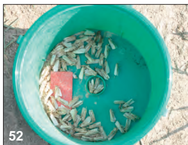
Corn borers caught in trap

Pheromone traps can be effective for monitoring populations of SWCB. A sharp increase or “spike” in moth captures should not be a cue for an automatic insecticide application but intensified scouting. Additionally, there is often