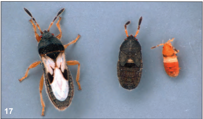
Chinch bug adult (left) and nymphs

Damage: Both adults and nymphs damage plants with their piercing-sucking mouthparts. Extensive feeding will cause plants to wilt, and some may eventually die. Plants surviving heavy feeding damage by chinch bugs are stunted and develop slower than unaffected plants.