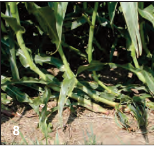
“Goosenecking” of corn

the soil surface. Rootworm larvae will also tunnel within the roots. Damaged plants surviving rootworm infestations will often lodge later in the growing season due to underdeveloped root systems. This sometimes results in what is referred to as “goosenecking” of corn.