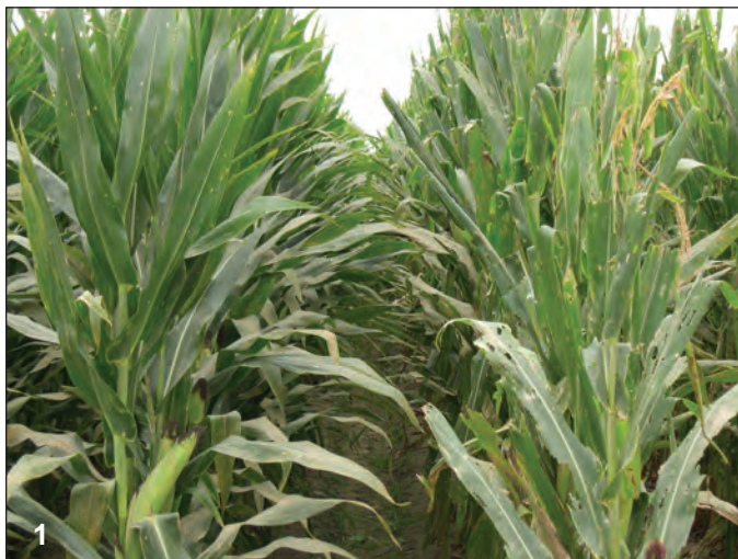
Insect injury on Bt corn (left) and non-Bt corn (right)

For resistance management strategy, a refuge area of non-Bt corn must be planted when using Bt corn hybrids. This guide will not go into specifics with respect to refuge requirements, because these requirements may vary considerably, depending on geographical location and which Bt traits are being used, and may change over time. It is recommended that you consult the licensing agreement that comes with the Bt hybrids selected for planting for a given season.