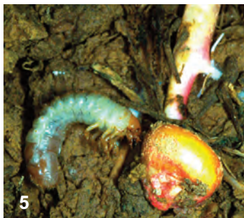
Japanese beetle grub

Grubs of Japanese beetles are similar to white grubs, in that they are white with a brown head capsule, have chewing mouthparts and may also curl into a “C” shape when disturbed. Japanese beetle grubs, however, can be identified by the V-shaped