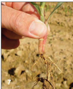
Southern corn rootworm damage