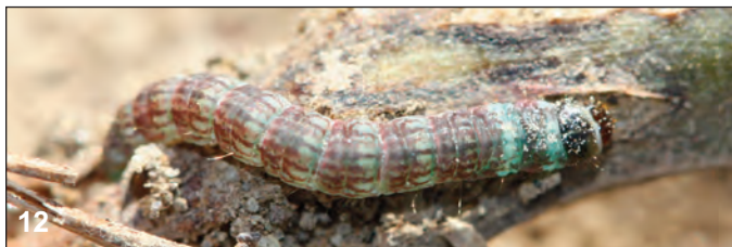
Lesser cornstalk borer larva

This lepidopteran pest is more likely to occur in sandy soils and under dry conditions. Larvae are slender and greenish-purple in color and wiggle around violently when disturbed. They also rarely develop to a size over 2/3 inch in their final instar.