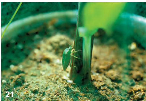
Southern green stink bug

Management: Many insecticides are effective against stink bugs found in corn. However, differences in control are often noted between brown and green stink bugs, with green stink bugs being typically easier to control with labeled pyrethroids than brown stink bugs.