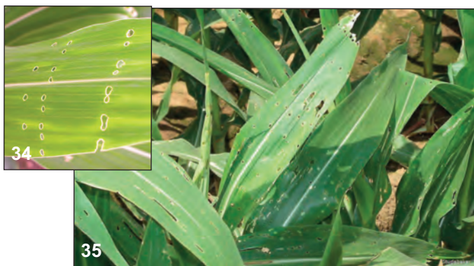
Corn borer damage to leaves

larvae. Fall armyworm and corn earworm typically do more substantial leaf feeding in the whorl than corn borers as their entire larval development takes place in the whorl, whereas corn borer larvae move into the stalk once they reach sufficient size to do so.