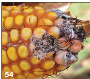
Corn earworm damage