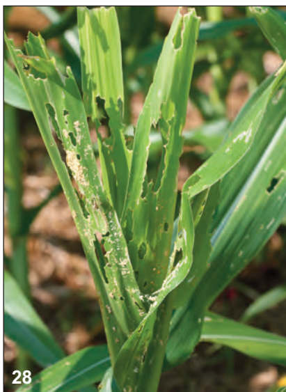
Tattered leaves due to fall armyworm feeding