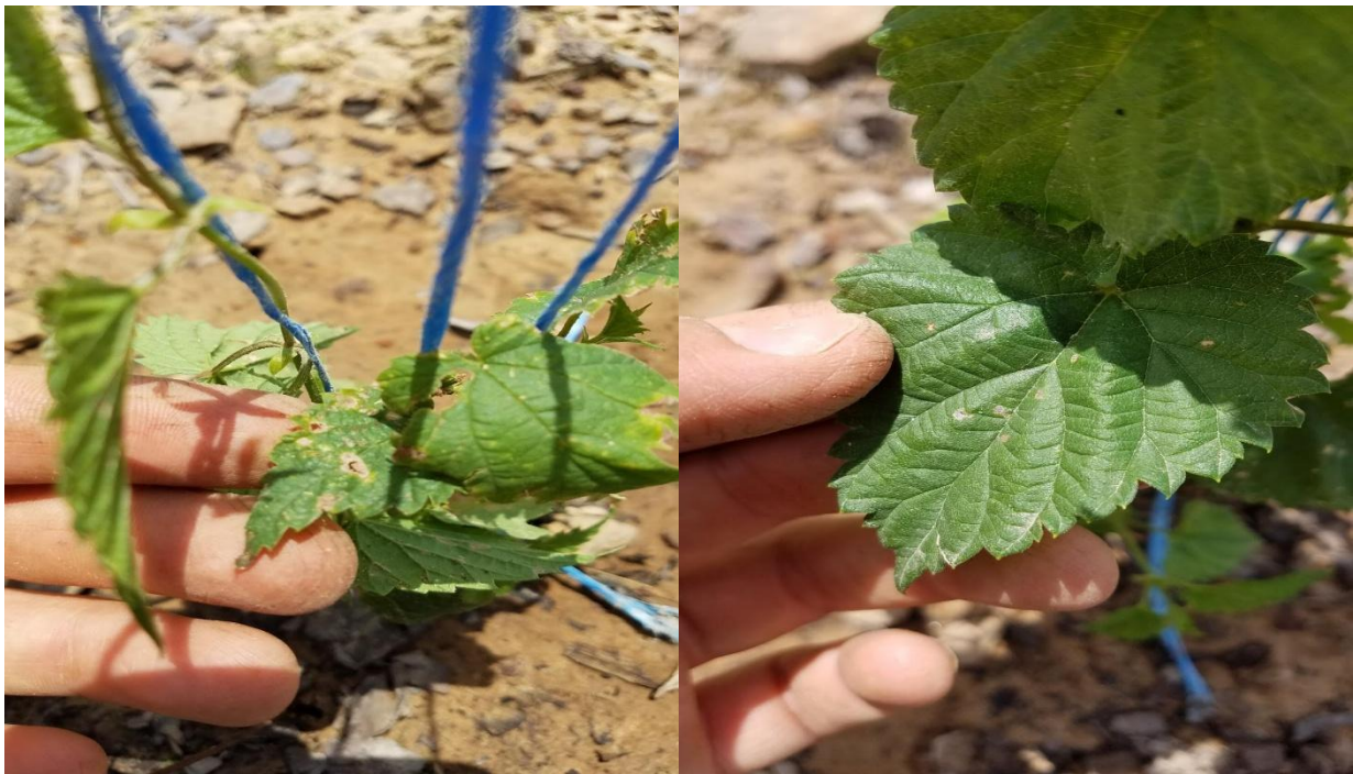
Pictures 6, 7: potential army worm/mite damage (left), and fungal disease (right)

An initial fungicide spray application of 2.5lbs/ac of Aliette was applied on June 12th. An insecticide spray application (4oz/ac using Mustang Maxx) was sprayed June 19th. Biweekly, spray applications of both fungicide and insecticide (alternating Aliette or Pristine with Mustang Maxx) commenced to control for pests and fungal growth. The previously established, observational grow sites in West Fork and Booneville also experienced infestations of army worms and downy mildew, so a backpack spray application of Dipel (2tsp/g) in West Fork and a combination of copper and B.T. ( Bacillus thuringiensis ) in Booneville were spread on the 14th and 16th of June, respectively.