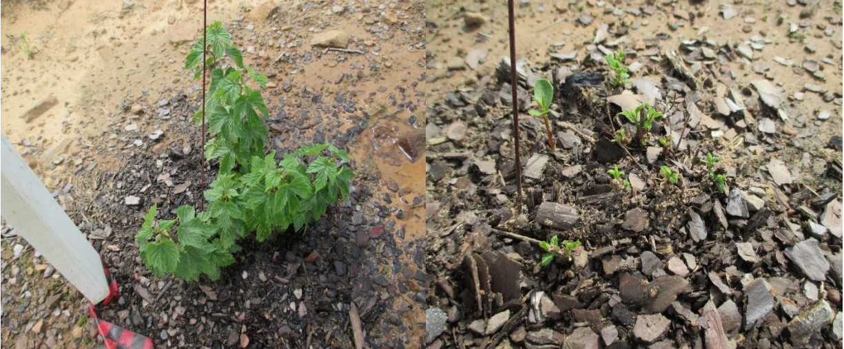
Picture 4: Zeus prior to pruning (left), and Zeus one week after pruning (right)