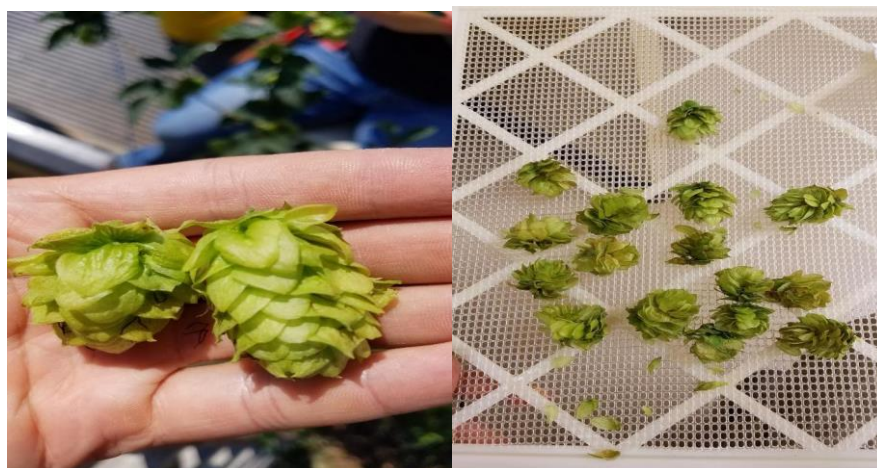
Pictures 16, 17: hops from the Zeus cultivar prior to drying (left); Zeus cones immediately after drying for 4 hours (07/17)

The hops are still being collected and analyzed at the Fruit Research Station and at the University's Food Science Department, and by comparing the latest data regarding the physical characteristics of the cultivars (Table 7) alongside the harvest information (table 8), several key takeaways are evident. Both Zeus and Cascade exhibited the most promising lateral growth and cone development, and they resisted disease pressure to a greater extent throughout the growing period. The Cascade cultivar produced the most laterals on average (standard and pruning study) while the Zeus variety displayed the most rapid growth to the top of the trellis along with an earlier flowering time, slightly longer lateral length, greater overall cone size and relative height to the trellis. Within the Cascade shoot pruning trial, the data also indicates that the vines cut down earlier in the season (April 15th and May 1st) have smaller average cone weight, fewer laterals, and a shorter average bine height compared to the Zeus cultivars. The remainder of the hops from these two varieties along with the Centennial, Cashmere, Crystal, and Nugget cultivars are expected to be harvested on a weekly schedule over the course of several dates in August. This information will add to the ongoing study at the Fruit Research Station and allow the team of homegrowers and researchers to assess the feasibility of hops production in the region.