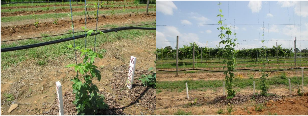
Picture 9, 10: Illustration of rapid growth in height and lateral production in just two weeks on 'Zeus' 6/19/19-7/5/19