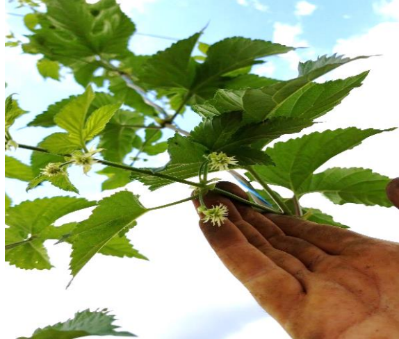
Picture 8: Female flowers emerging from the lateral of a 'Zeus' bine in late June

stems typically form at each node along the entire length of the main bines (one or two laterals per node may form, 2 is most common). Lateral shoots are usually where the plant produces flowers (Picture 8) and eventually the cones are formed. For this reason lateral shoot production may be a key indicator of potential yield.