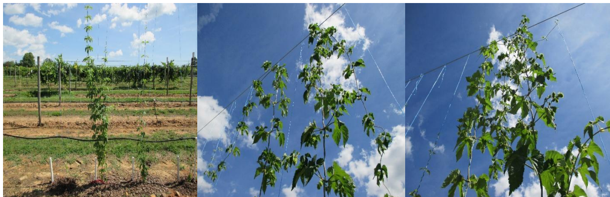
Pictures 11-13: Zeus bines reaching top of the 15' trellis wire and beyond with cones emerging from all upper laterals (July 11)