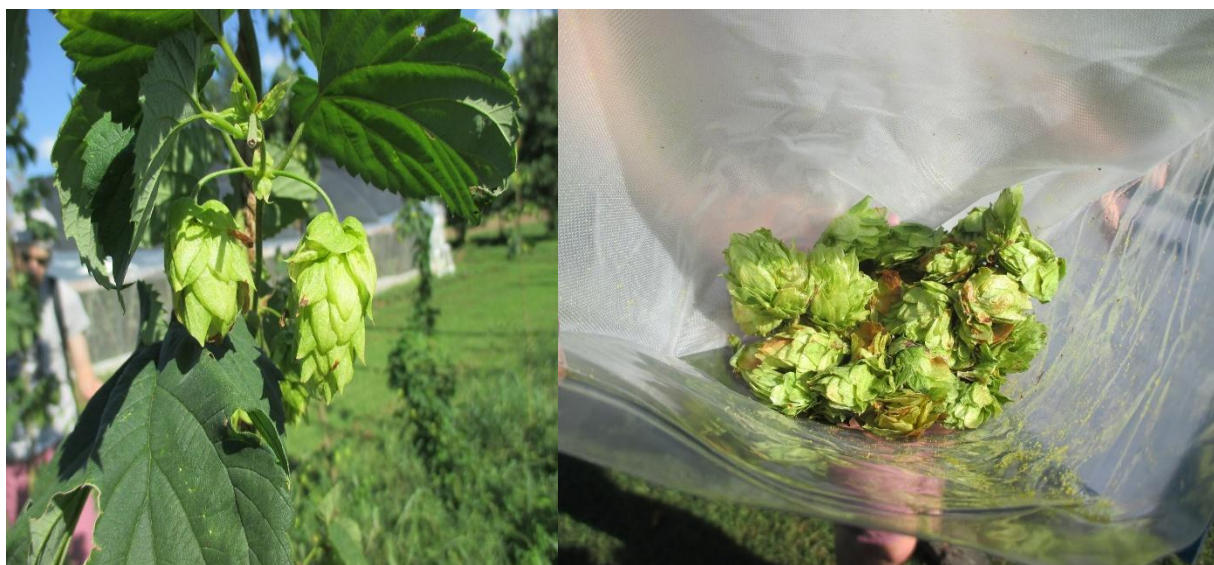
Picture 14,15: Chinook hops before harvest - West Fork, Arkansas site (left); & harvested Cascade cultivar (right) - West Fork, Arkansas (July 17)

After the third date of data collection on plant characteristics, it was evident that practically all of the Zeus and Cascade cultivars were ready to harvest based on several factors: overall shape, texture, size of the cones, development of lupulin glands within the hops cones, and the comparison to harvested hops at the observational grow sites. During development, the hops cones feel compressed and moist to the touch, and as they age the hops develop a distinct paper-like, crisp consistency and they exude an aroma that is often compared to freshly cut grass or green onions when crushed. Another sign that the cones were ready to harvest was the development of bright yellow lupulin inside of the thin folds called bracteoles; these sticky compounds contain the acids, aromatic oils, and resins that give the hops their distinct smell and taste once dried and incorporated into tea or beer.