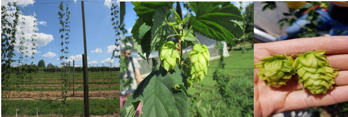
Picture 1-3: 15' bines of several varieties of hops in mid-July growing on the training wire attached to the trellis at FRS (left); one node with two cones (middle); cones after harvest (right.)