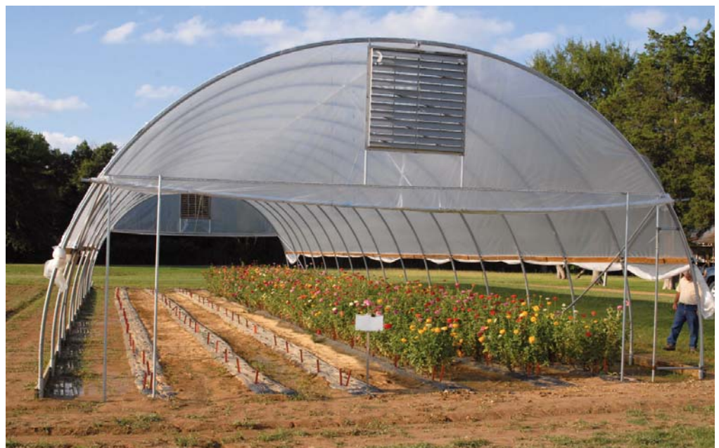
FIG. 1. Typical Quonset-style high tunnel design

Visit our web site at: https://www.uaex.uada.edu