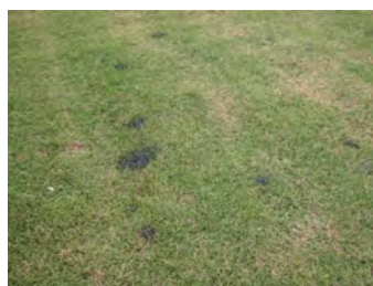
Figure 4. Physarum sp. on turfgrass

Physarum sp. is the most common slime mold on turfgrass. The fruiting body is dark gray to black and contains purple spores. These slime molds resemble soot and occur in small groups or rings in the grass (Figures 4 and 5).