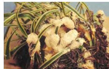
Figure 3. Fuligo sp. on Lirope