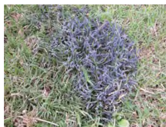
Figure 5. Closeup of Physarum sp. on turfgrass