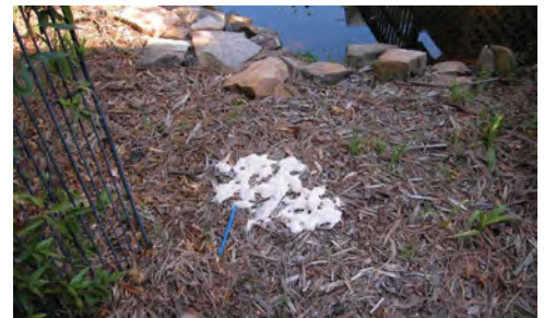
Figure 1. Fuligo sp. on wood mulch

that are yellow or cream-colored, crusty masses that resemble dog vomit or scrambled eggs (Figures 1 and 2). These are the most commonly seen slime molds in the landscape. Sometimes slime molds may use landscape plants for support, giving them an unsightly appearance (Figure 3).