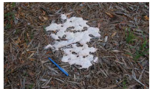
Figure 2. Closeup of Fuligo sp. on wood mulch