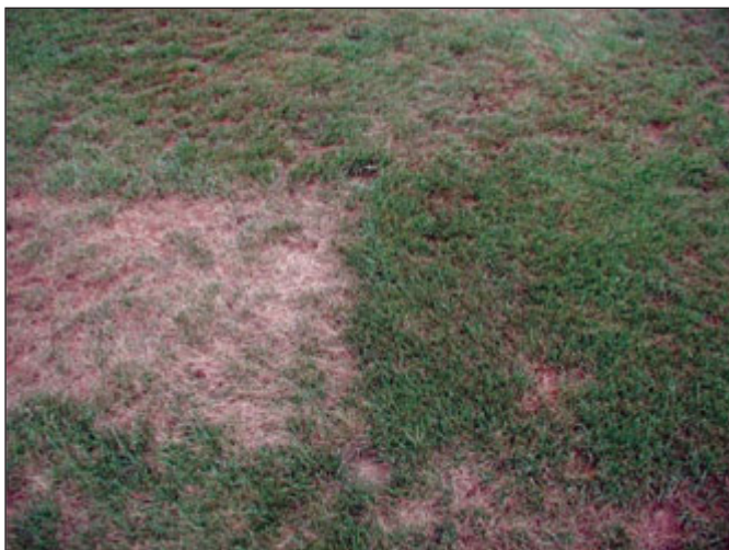
Figure 4. Visible differences between brown patch tolerance among two tall fescue cultivars

Fungicides may be necessary on highly visible or high-value commercial or residential turf. These materials are most effective when applied on a preventative program, beginning when conditions favor disease onset. Materials containing the active ingredients propiconazole, triadimefon and