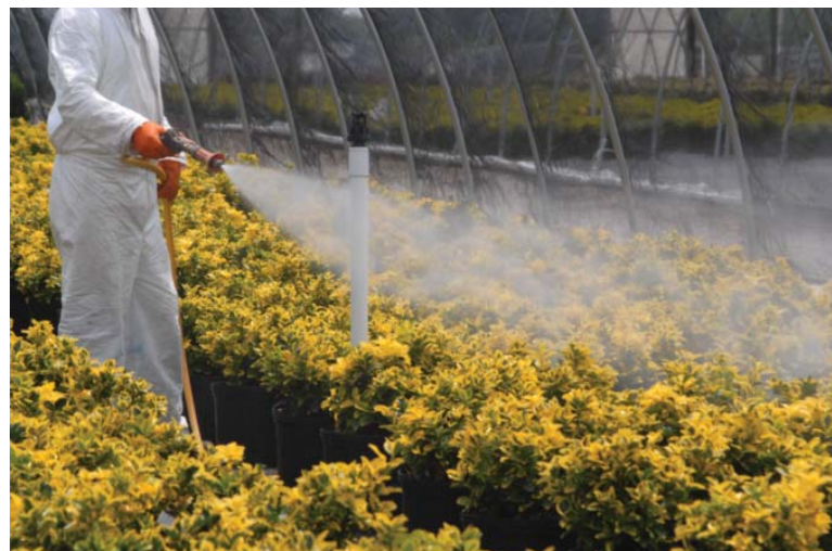
FIGURE 1. Fungicides can be an important component in a disease management program.

Systemic fungicides are absorbed into the plant tissue and may be translocated within the plant. Some materials can enter and move within the conducting vessels of the xylem and phloem and are called “true systemic,” whereas others may only move short distances to immediately