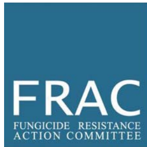
FIGURE 2. Fungicide Resistance Action Committee (FRAC) logo

have a high probability for fungal resistance to develop if they are misused. Sometimes a fungus that develops resistance to one active ingredient may also be resistant to other similar active ingredients. This situation is known as cross-resistance, and FRAC codes categorize products together that have closely related modes of action. For example, all fungicides with strobilurin chemistries will belong to FRAC code 11, and those belonging to the carbamate group belong to FRAC code 28.