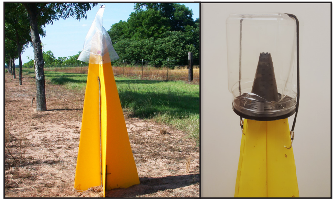
Figure 2. Stink bug trap installed at a pecan orchard.