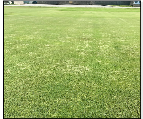
Figure 2. Collection of moss "tufts"- or gametophytes.