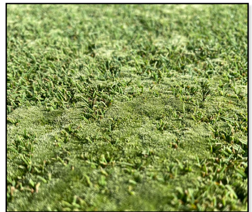
Figure 3. Individual gametophores with silvery tips.