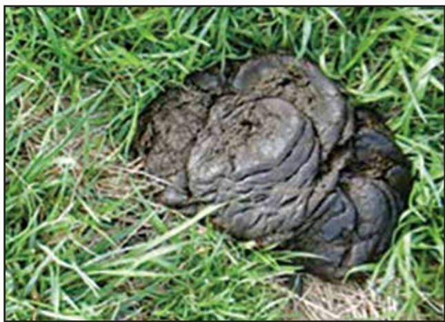
FIGURE 3. The challenge for beef producers is to utilize manure without impacting water quality. This is achieved through appropriate management strategies, particularly maintaining pasture canopy height and applying suitable grazing methods.

Grazing animals can have either a positive or negative effect on water quality, depending on the way their grazing patterns are controlled. Proper grazing management favors pasture productivity and reduces the potential for soil erosion and manure runoff. Healthy and vigorous canopy cover protects and enhances water quality by lessening the impact of precipitation which dislodges soil particles, thereby reducing the amount of sediment in surface runoff as well as the volume of runoff water.