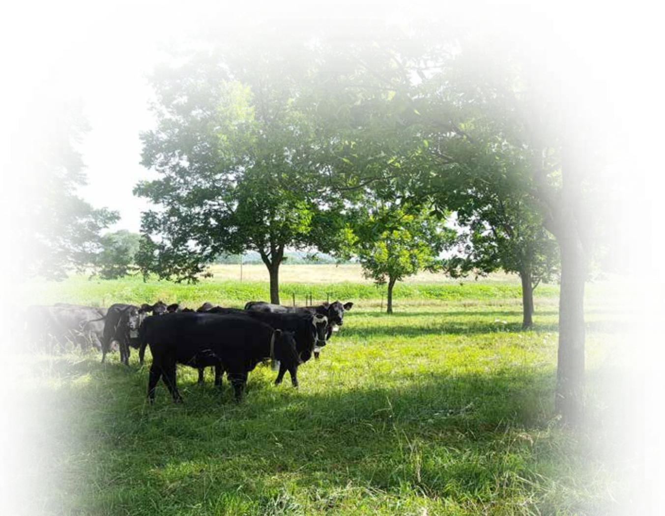
FIGURE 10. Shade is important to cattle productivity and should be managed to reduce potential non-point source pollution.

Shade is important to cattle productivity and should be managed properly. Cattle may select natural shade as a loafing area, or producers may provide artificial shade to provide heat relief for their cattle. If cattle use the shade a few hours a day, manure accumulation and loss of vegetation will result. Move portable shade on a regular basis to allow for vegetative regrowth. Rotate pastures or use electric fencing to keep cattle from concentrating in one small area if they are loafing under natural shade. This reduces the potential for damage to trees and vegetation.