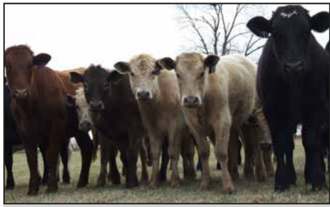
FIGURE 2. Beef production is a vital contributor to the Arkansas agriculture. The total impact of the state's beef industry is over $1.4 billion.