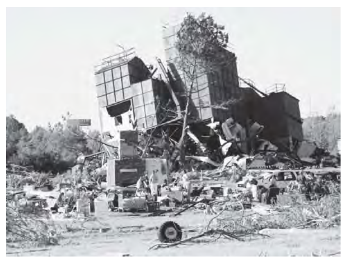
Figure 2. Tornado damage in Damascus, Arkansas, on May 2, 2008.

Note: The Enhanced F-scale is a set of wind estimates (not measurements) based on damage.