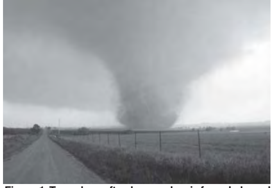
Figure 1. Tornadoes often have a classic funnel-shaped cloud associated with the whirling updraft.

Tornadoes are mobile, destructive vortexes of violently rotating winds which have the appearance of a funnel-shaped cloud and advance beneath a large storm system (see Figure 1). They may appear nearly transparent until dust and debris are picked up or a cloud forms within the funnel, making them deadly. Good warning systems allow citizens to be alerted before a tornado is visible, making safe survival more likely. Therefore, during bad weather, we must be alert and tune in for warnings. If a tornado should strike, well-made plans for emergency shelter can overcome this disaster and bring you, your family and your community through without personal injury. This fact sheet highlights the frequency of tornadoes in Arkansas and the importance of following the safety tips if a tornado watch or warning is issued.