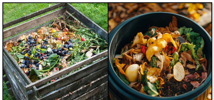
Figure 2. Examples of units to hold yard and garden wastes until composting is complete.

The approach depends on the time that finished compost is desired, materials and space available. Turning units require regular (weekly or biweekly) maintenance. To turn a compost pile, use a shovel or a pitchfork to invert the compost material and agitate the pile. Turning will introduce oxygen, break up congealed mats (common with grass clippings) and mix the microorganisms to new food sources in the pile. Turning a pile may also mean moving compost from one bin to another in a multi-bin system. If kitchen wastes are to be composted without other materials, worm composting or soil incorporation (burying) should be used. To turn a compost pile, use a shovel or a pitchfork to invert the compost material and agitate the pile. Turning will introduce oxygen, break up congealed mats (common with grass clippings) and mix the microorganisms to new food sources in the pile. Turning a pile may also mean moving compost from one bin to another in a multi-bin system. If kitchen wastes will be mixed with yard wastes, the turning method is recommended. However, holding units or heaps may work when precautions are taken to minimize pest problems. Turning the pile frequently by using a pitchfork or shovel to agitate