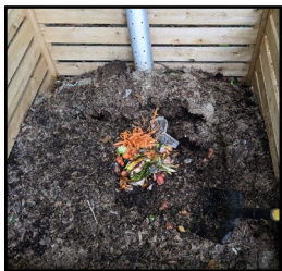
Figure 6. Kitchen scraps incorporated in compost bedding.

Compost can be harvested when the bin contents have become fairly uniform, dark, “worm castings.” This usually takes three to six months. Finished compost can be harvested by moving it to