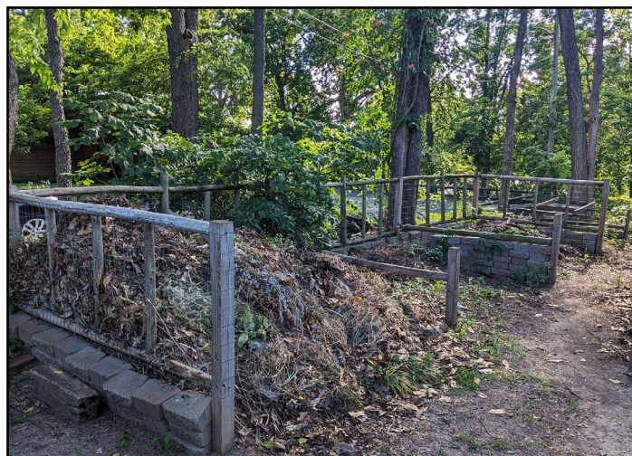
Figure 3. A series of bins used to speed composting.

turning the compost, more oxygen is provided to the microbes decomposing the wastes.