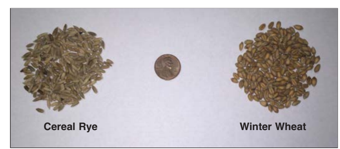
Figure 2. Comparison of cereal rye seed size and color to soft red winter wheat.

Cereal rye seed is grayish brown in color and will be thinner and more elongated than the soft red winter wheat seed most often sown for grain in the Mid-South U.S. (Figure 2). Cereal rye seed looks very different than annual ryegrass seed which should not be planted in Arkansas as a winter cover crop. The most efficient establishment technique is using drills or planters similar to those used for the establishment of a winter wheat crop, but it can be accomplished with aerial or