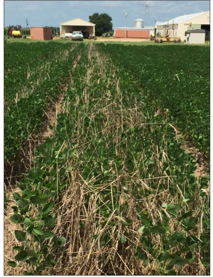
Figure 5. Soybean planted into cereal rye cover crop.

addition of 2,4-D. Blends that contain multiple broadleaf species, especially winter peas, will typically require a three-way mixture of glyphosate, Sharpen and 2,4-D or glyphosate, dicamba and 2,4-D. If termination applications are made closer to planting, paraquat plus a PSII inhibitor such as metribuzin (soybean), atrazine (corn) or diuron (cotton) will provide effective control. Please remember that cereal rye can be a large biomass producer and earlier termination can help alleviate the large amounts of biomass at planting of the cash crop.