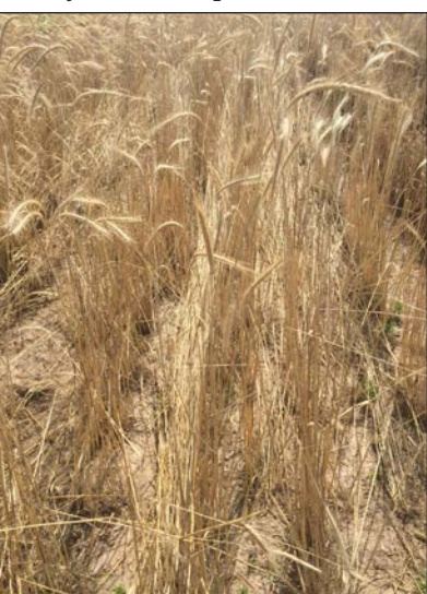
Figure 4. Headed cereal rye terminated at heading immediately prior to soybean planting.

22 fluid ounces per acre of glyphosate applied prior to the boot stage. Earlier termination of the rye cover crop (prior to the boot stage) typically leads to better results. When cereal rye is planted in a cover crop blend, multiple herbicides will need to be added to glyphosate for effective control. Blends including vetch can be controlled with the