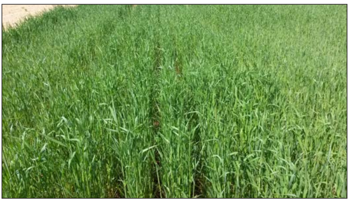
Figure 3. Cereal rye cover crop at early boot stage planted at 40 pounds of seed per acre.

broadcast seeding and shallow incorporation with something similar to a Kelly Diamond Harrow.