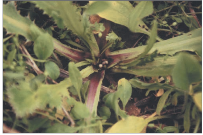
Figure 8. Musk thistle rosette infested with rosette weevil larvae.

Prevention of a musk thistle infestation is easier than eradicating a population that has become well established. New infestations of musk thistle or invading scattered plants on a farm should be eradicated before seed production occurs. A combination of methods previously described provides more effective control than reliance on any single method.