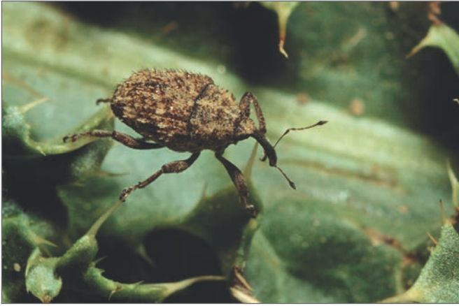
Figure 7. Adult musk thistle rosette weevil.