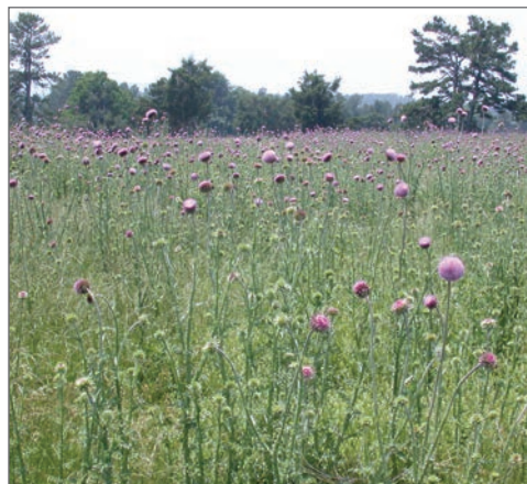
Figure 1. Flowering musk thistle plants.

Visit our web site at: https://www.uaex.uada.edu