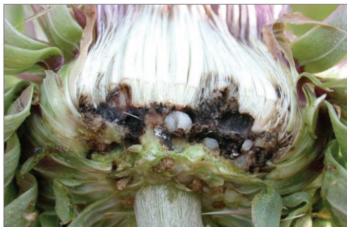
Figure 5. Musk thistle flower infested with weevil larvae.