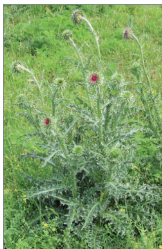
Figure 2A. Bolted musk thistle beginning to flower.

After seed germination, the plant develops a fleshy taproot with a rosette of leaves. The plant overwinters as a rosette. Seed stalks are formed in spring as the plant starts to bolt, followed by flowering which normally begins in early to mid-May (Figure 2A). Occasionally some plants can be found blooming through August. The plant dies after all its seeds mature.