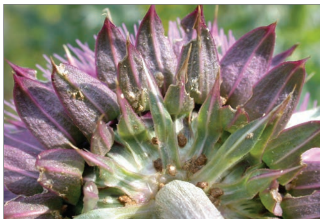
Figure 4. Flower head weevil eggs covered with plant material.

Larvae feed for about 25 to 30 days then begin pupation. Pupation lasts another 8 to 14 days. The pupa rests in an excavated cell in the flower, where it transforms into an adult. The adults emerge in July and seek overwintering sites under new musk thistle rosettes, ground litter or wooded areas, where they will remain dormant until the following spring. Flower head weevils usually produce only one generation per year.