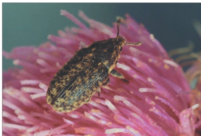
Figure 3. Adult musk thistle flower head weevil.

Musk thistle flower head weevils overwinter as adults. The adults are slender and brown with scattered golden spots on the wing covers (Figure 3). They are about \frac{1}{4} inch long and have a short, broad snout. In early spring, the adults emerge from overwintering