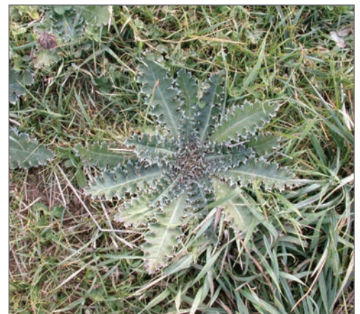
Figure 2. Musk thistle rosette.