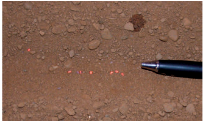
Figure 3. A small amount of painted seed added to the seed box can help determine seeding depth.

After calibrating the drill, plant test strips to determine the depth at which seed is being planted. Small seeds are difficult to see in the row. A small amount of seed can be spray painted bright orange and allowed to dry thoroughly, mixed with plain seed and placed in the drill seed box immediately above each seed outlet. The colored seed is easily seen in the row. ( Note: Make sure the painted seed has dried completely before putting it in the drill. Otherwise it