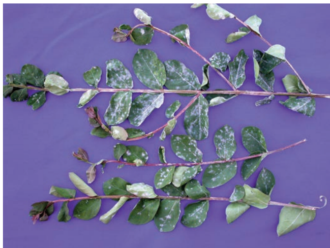
Fig. 2. Powdery Mildew of Crapemyrtle

For woody ornamental plantings that have a history of persistent powdery mildew, regular applications of a systemic fungicide may be necessary to manage the disease. If fungicides are considered as part of an overall control program, applications need to begin in the spring at the first evidence of the disease. Elemental sulfur is an effective fungicide on many plants. Other fungicide choices include materials that contain such active ingredients as triforine, propiconazole, triadimefon and myclobutanil. Consult Extension publication MP154, Arkansas Plant Disease Control Products Guide , for specific recommendations, available at www.uaex.uada.edu . Contact your local county Extension office for additional information.