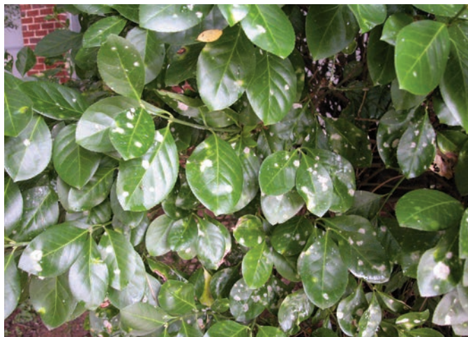
Fig. 3. Powdery Mildew of Euonymus