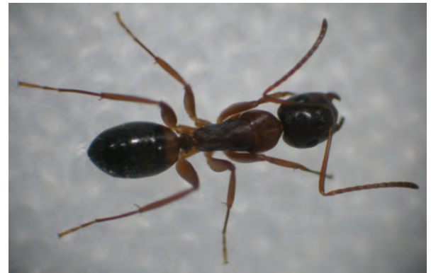
Figure 1. Carpenter ant (worker)

These ants usually nest in logs, stumps, hollow trees or decayed wood, but may be found nesting in sound lumber. Infestations often occur in or near homes where they may be confused with termites. Carpenter ants are most active at night, emerging from the colony after sundown.