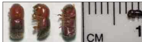
THE GRANULATE AMBROSIA BEETLE Xylosandrus crassiusculus (Motschulsky), Coleoptera, Curculionidae

Granulate ambrosia beetles have many reported hosts. Among the most common are red maple, redbud, styrax, ornamental cherry, pecan, peach, plum, cherry, persimmon, Japanese maple, golden rain tree, dogwood, sweet gum, Shumard oak, Chinese elm, magnolia, fig and azalea.