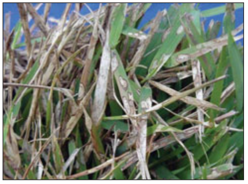
Figure 1. Rhizoctonia leaf lesions

On tall fescue, symptoms are readily recognizable on the leaves as straw-colored lesions with a dark brown edge ( Figure 1 ). Under optimum weather conditions, these lesions expand to kill the entire leaf. Diffuse olive-green circular patches of