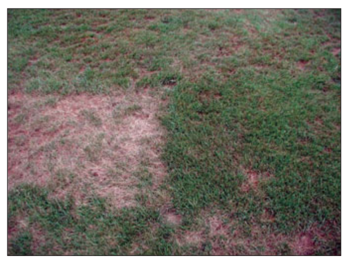
Figure 4. Visible differences between brown patch tolerance among two tall fescue cultivars