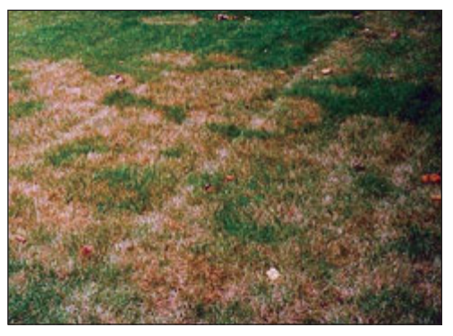
Figure 2. Brown patch in tall fescue

declining turf can occur following infection. Over time, grass in the interior of these patches starts to recover, producing a "smoke ring" appearance ( Figure 2 ).