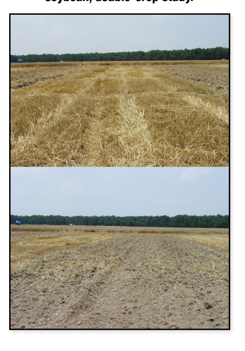
Figure 1. Field in St. Francis County, AR with no-tillage (top panel) and conventional tillage (bottom panel) strips as experimental treatments in a wheat-soybean, double-crop study.

Studies evaluating GHG emissions from climate-smart practices used in cotton production